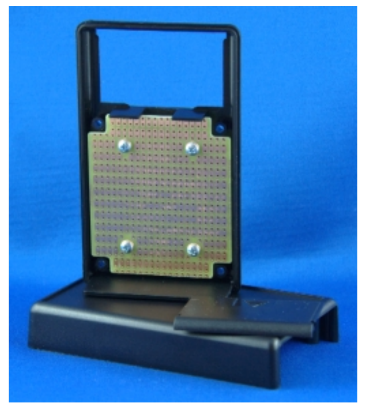
PR1593Q Prototyping Board shown with the Hammond 1593QBK box (box not included).

To purchase the PCB + Box together, order BPS part# KIT-1593Q-BK